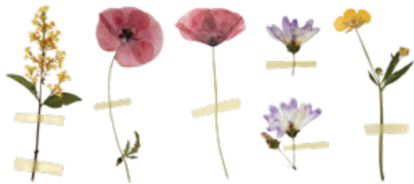
Press flowers for several days between two heavy books to flatten them before adding them to your nature notebook.

Very occasionally, and with your parents' approval, you can include in your nature journal samples of the leaves and bits of nature you find outdoors (as long as they are not too bulky). However, be careful not to disturb too much of nature when taking a specimen. You wouldn't want to remove the only flower in a field. You could disrupt the natural cycle of that plant's growth.