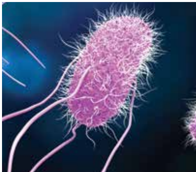
Kingdom Monera includes bacteria.

Do you like to have things organized? Do you like it when all your shirts are in one drawer, your socks are in another drawer, and your pants are in yet a different drawer? It makes life a lot easier when we are organized. Well, biologists like to organize things too. Living things. God created so many different