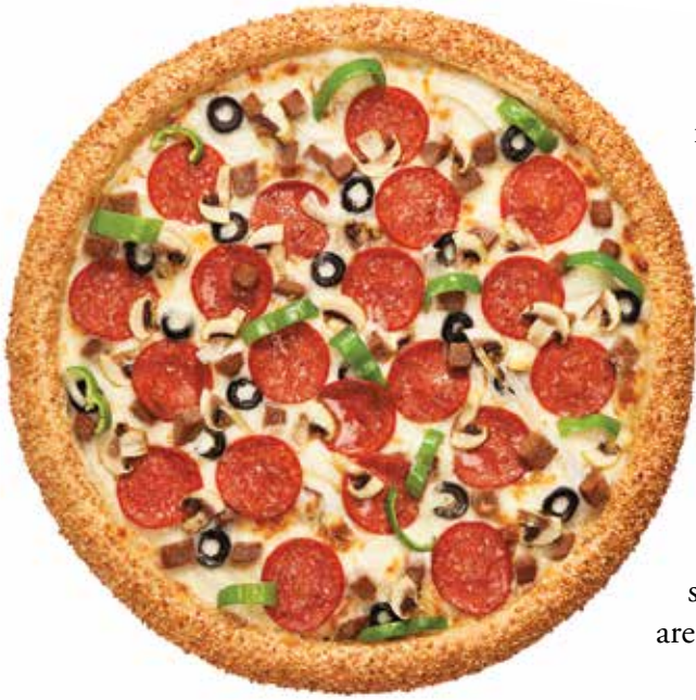
This pizza could not exist without plants.

By understanding the secret world of botany, you'll become an expert on what it takes to grow and nourish plants and help them flourish in this world. When you're done with this first lesson, you will create a special structure called a light hut that's designed to grow plants from seeds any time of the year. You can plant any seeds you want, but I recommend herbs if you're starting in the fall because herbs can be grown indoors through the winter. If you are beginning in the spring, plan for fruits and vegetables because you'll be planting an edible garden outside! That means you'll grow food like