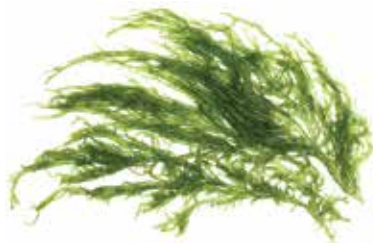
Kingdom Protista includes algae.