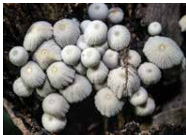
Kingdom Fungi includes mushrooms.