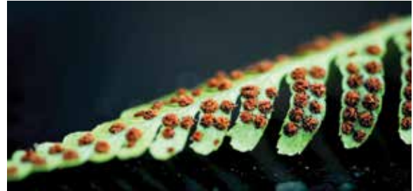
Each of the clumps on this fern contains millions of spores.

Even though seeds and spores both grow into plants, spores are not seeds. You see, a seed is