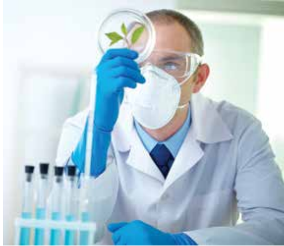
Botanists are scientists who specialize in the study of plants.