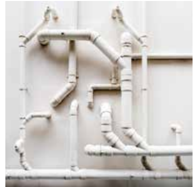
Behind the walls of your house are pipes and tubes where water and gas flow.

Look at the leaf in the picture. Do you see the veins? These veins carry water and other important nutrients throughout the plant. Although you can actually see many of the tubes in a plant by just looking at its leaves or flowers, many are also hidden inside the plant and are hard to see. That's the way it is with the tubes inside you, too!