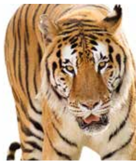
Kingdom Animalia includes all the animals.

living things that biologists have spent a great deal of time separating them into different groups, called kingdoms. This helps biologists keep things organized. They've put plants in one huge group, called the plant kingdom, or Kingdom Plantae (plan' tay). They've also put mushrooms and other similar growths in their own group called Kingdom Fungi . We will study these two kingdoms this year. But there are other living things, aren't there? Can you think of a living thing you've seen recently? You might have mentioned some kind of animal. Maybe next year you will begin studying the creatures in Kingdom Animalia (an uh