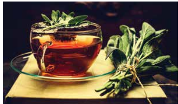
For thousands of years, herbs have been used for healing as in this sage tea.

So what do botanists actually do? Well, have you ever taken medicine that healed you of an illness? Some botanists study plants that are used to make medicines that cure diseases. In fact, many different medicines are made from plants. Before modern medicine, people relied on healers who knew which plants helped to cure which diseases. They weren't officially called doctors, nor were they called pharmacists. But they were actually both. A doctor figures out what's wrong and then prescribes medicine that a pharmacist prepares for the patient. Many years ago, the healer figured out the problem and prepared the medicine using mostly plants. For example, if someone came down with a bad cold, a healer might make a tea from the sage plant. Sage is an herb that has many healing properties. Not only does it help with colds, but it also fights bacteria and helps with breathing problems. In fact, its scientific name is Salvia Officinalis , a word which means "the plant saves people."