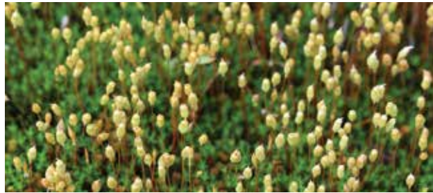
These moss spores are tiny because they don't contain food for the baby plant.

a very special plant package. It contains a baby plant, food for the baby plant, and a protective covering. You can think of a seed as a baby plant in a box with its lunch. A spore is just the baby plant and a protective coating. There is no food for the baby plant. Since there is no food in a spore, spores are much smaller than seeds. They also need extra special conditions to grow. We'll learn all about that in a later lesson.