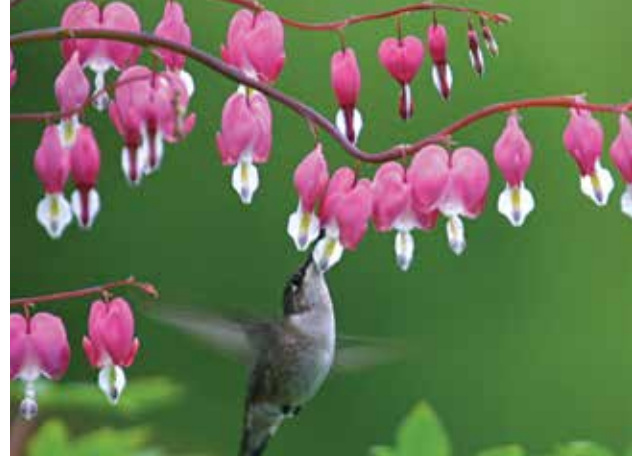
Birds will feed on the nectar in these bleeding heart flowers.

Now let's learn about nature journaling and get started on our scientific studies.