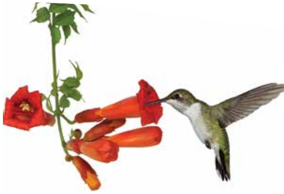
The design of these flowers is perfect for giving the hummingbird food.

As you journey through this book, you'll learn about soil, seeds, roots, leaves, flowers, creatures that help plants grow, trees, and so much more. You'll do projects like create a miniature indoor greenhouse (the light hut I mentioned earlier) and make a field guide of plants in your area. You'll do experiments with plants, like changing the color of flowers. You'll also record what you learn in your Botany Notebooking Journal. Very soon, you'll make a special book called a nature journal and, like a true scientist, you will record your scientific observations of the outdoor world on its pages. I think you'll enjoy digging into the natural world of plants and fungi, don't you?