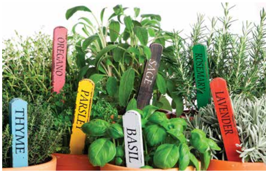
Herbs are easy to grow indoors and can be used for cooking.

fruit of the tomato plant. Several other fruits and vegetables add to the taste and flavor. But what about the pepperoni? It's made from pork and beef. Pork comes from a pig, and beef comes from a cow. Well, can you guess what pigs and cows eat? Plants! Without plants, there is no pork or beef. Indeed, almost every animal you eat—such as a chicken and fish—lives on plants. Of course, some people eat alligators, frogs, and such. However, even though those animals eat other animals, the animals they eat actually live on plants. So it all comes down to plants. We need them. And we should learn as much as we can about them because they are a vital part of life on Earth.