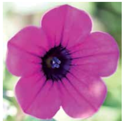
Each part of a vascular plant, even the flower, has tubes that transport fluid.