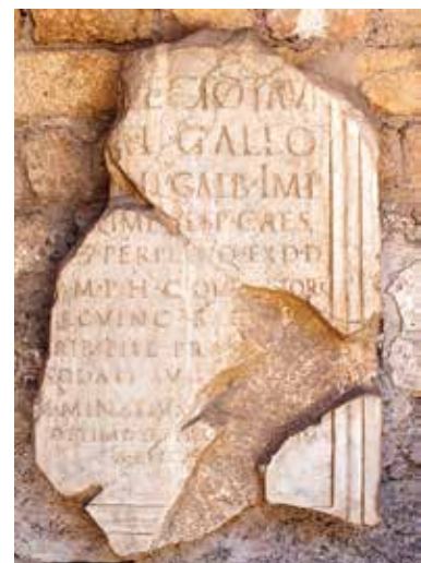
This is a Latin inscription on an ancient stone.

As it is with all sciences, you will learn the special vocabulary for the field of botany. Most often, the words you will learn come from ancient Latin or Greek languages. Since those languages are no longer spoken, they are great choices for science words. That's because the meaning of the words will never change. You see, in languages that are still in use, meanings change quite a bit. For example, many years ago, the word awful meant something that inspired a sense of awe. However in the language of our day, the word awful means something that is terrible. And we now use the word awesome to mean a sense of awe. So that's why you will find a lot of Latin and Greek words in science. They don't change and you will never be confused about what they mean. Don't worry about remembering all the vocabulary words you learn. The most important thing is that you develop a strong understanding of the science of botany and build memories of your learning through lots of hands-on experiences. Nevertheless, I am going to teach you a lot of new words this year. Let's take a look at some of these special words and find out more about the science of botany.