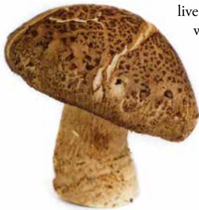
This mushroom is a fungus.

But botany isn't all we have planned for this year. In addition to learning about plants, you'll also learn about fungi (fun' jye). What on earth are fungi? Have you ever seen mushrooms growing outside? They are fungi. Because fungi also grow outdoors alongside plants, sometimes even helping plants, we're going to take one lesson to dive into the fascinating world of fungi. I think you'll find this special creation of God quite interesting.