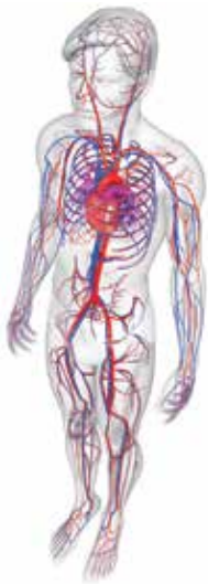
Inside your body are tubes filled with blood.

There are two main groups of plants, vascular and nonvascular. Before we discuss these two groups, I want to ask you a question. After you wash your hands in the sink, do you know where the water goes? Do you know where it comes from to get into the faucet? Well, it travels through tubes that are inside your house. Those tubes, or pipes, bring the water in and take the water out. You might say water is transported through these tubes. Guess what? That's one of the things botanists look at when dividing up plants: whether they have tubes in them or not. The plants with tubes are called vascular plants and the ones without tubes are called nonvascular plants . The word vascular just means a hollow container. The tubes are vessels inside the plant that transport fluids, like water.