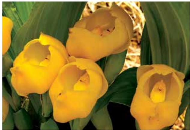
This cradle orchid is sometimes called a swaddled baby orchid.