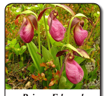
Prince Edward Island's Flower Pink Lady Slipper