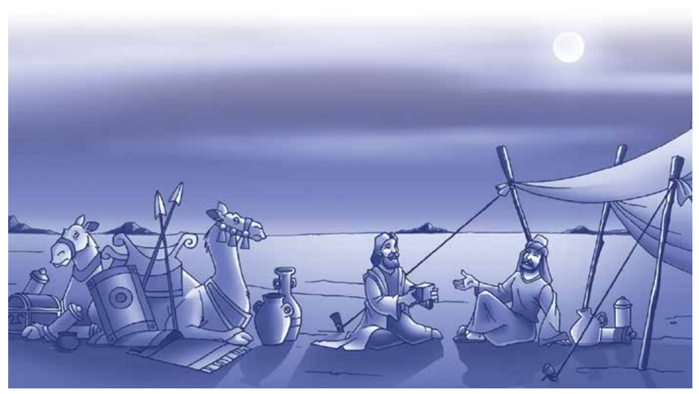
Abraham and Melchizedek

The Old Testament priest had to present a lamb without blemish as sacrifice to God for sin. Hebrews 7:22–28 describes the priestly office which Christ would hold. Hebrews 7:25