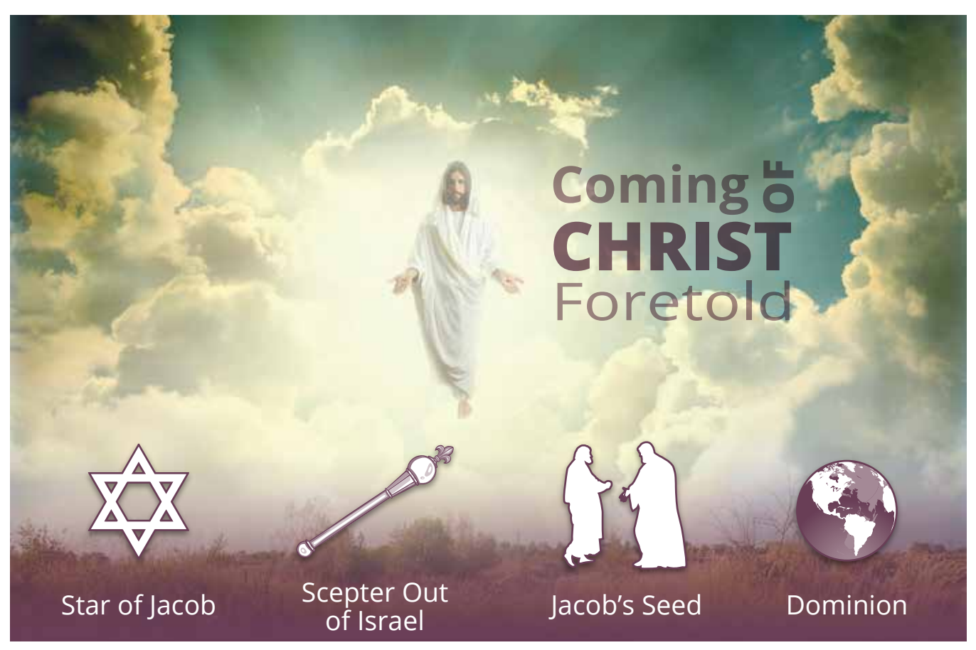
| Prophecy Symbols

light for blinded mankind who had lost God's fellowship.