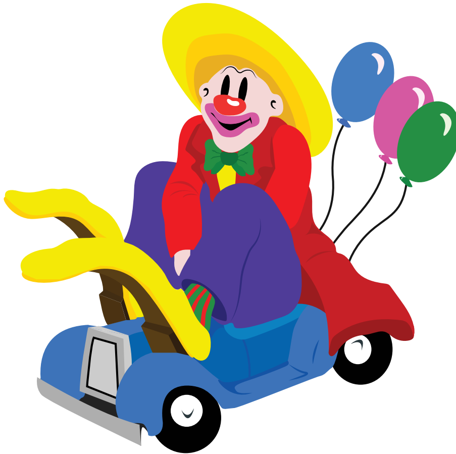
Bobo, the Clown