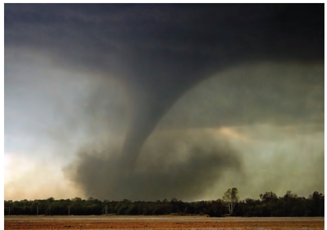
| Tornadoes are also known as twisters or cyclones.

From Calvert 3rd Grade History & Geography