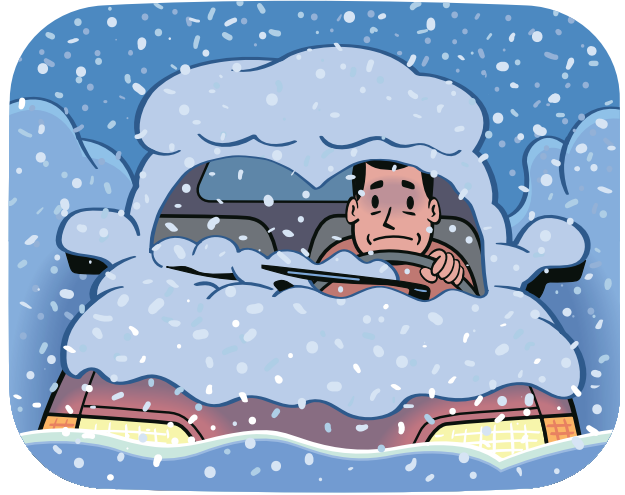
| Blizzards make driving dangerous.

Midwestern summer months are generally hot. In July, most of the states in this region have average temperatures around 85 degrees.