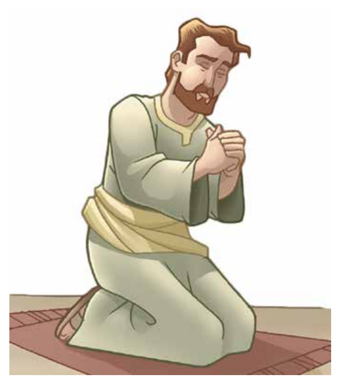
| Bowing in worship shows honor and respect to God.

You might wonder if a person can worship God without bowing before Him. When you meet a friend whom you have not seen for a time, you often shake his hand. Shaking hands is a physical act that shows your friendship, just as