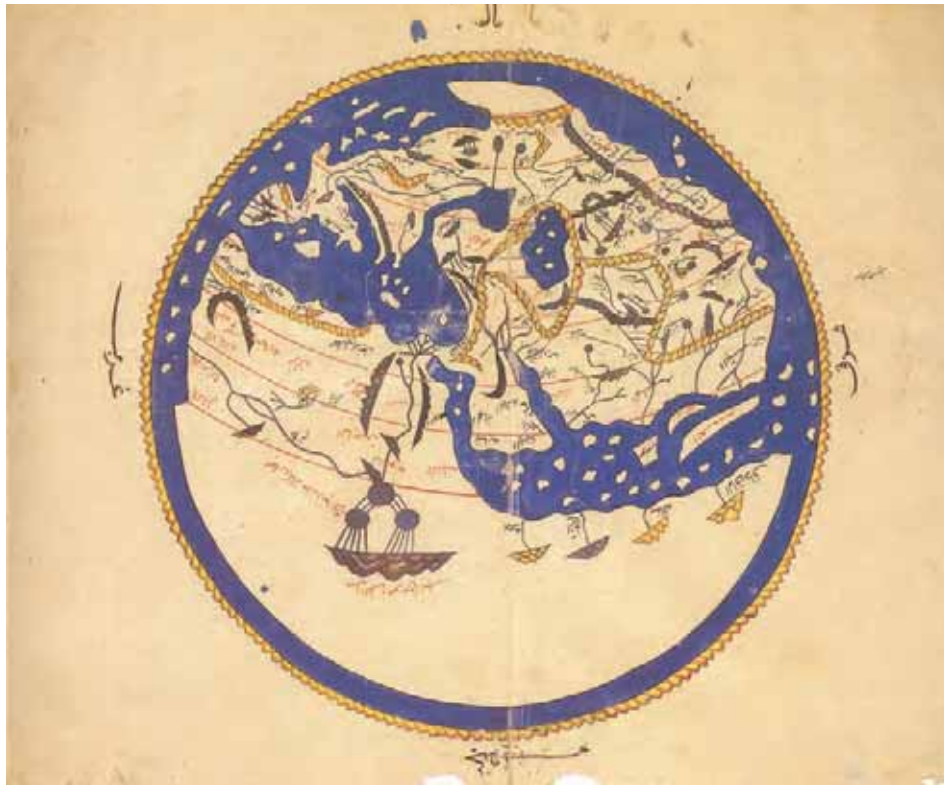
World Map Created by Muslim Scholar Muhammad al-Idrisi for Sicilian King Roger II (12th Century)