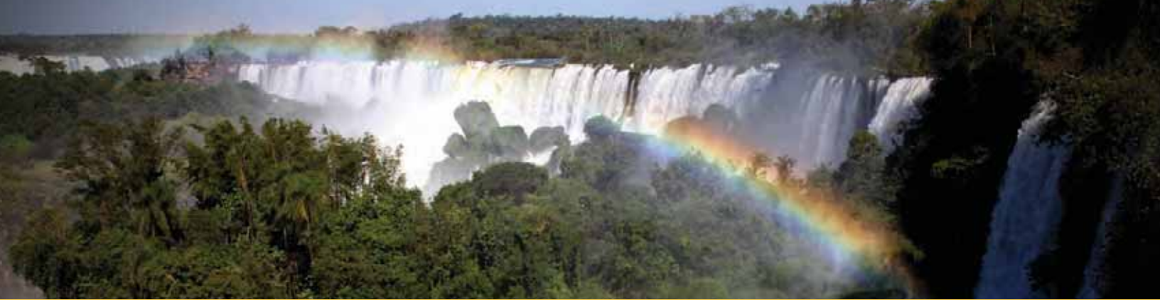
Iguazu Falls on the Border of Brazil and Argentina