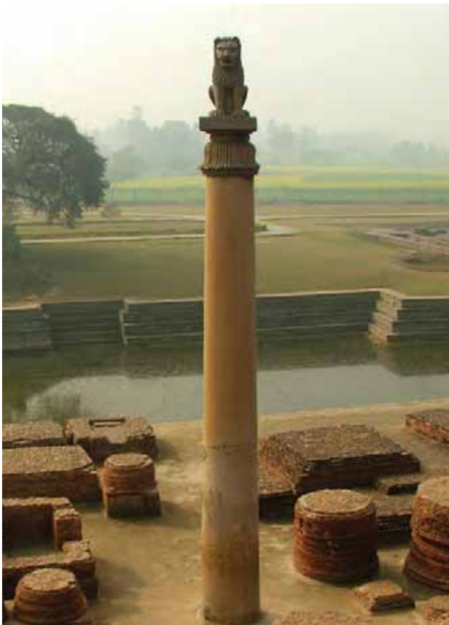
Pillar of Ashoka, Vaishali, India (Third Century BC)