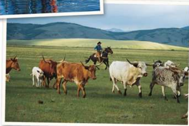
This rancher lives in a dry region.