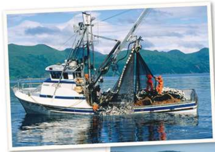
These fishermen live near the ocean.

In the United States, some people live on the coast near an ocean. Some people live on the rich farmland in the middle of our country. Some people live in rainy places and some in dry places. Different parts of the country are called regions .