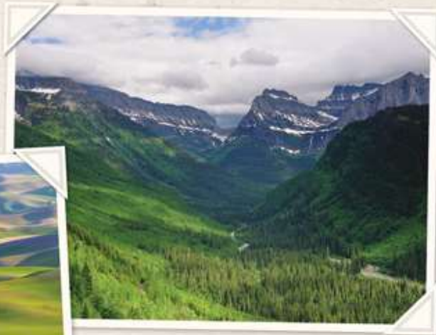
mountains and valley