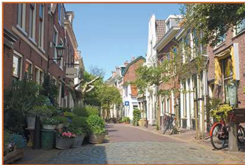
Haarlem, the Netherlands

“What if they have heard about this hiding place?”