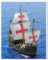
Columbus sailed on ships similar to this one.

Columbus set sail in August 1492. He and his crew arrived at an island in the Caribbean Sea on October 12, 1492 . Columbus named the island San Salvador . He called the people there Indians because he thought he was near India. He did not know that he had discovered lands that were new to the Europeans.