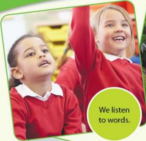
We listen to words.