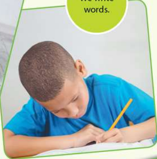
We write words.