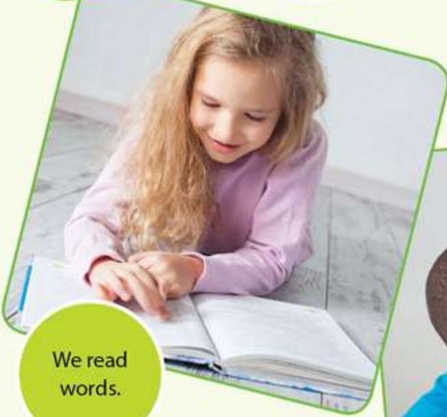
We read words.